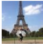
Kelley McLain @kelleylou6

@kelleylou6 Does everyone that wants to visit the bookfair need a badge?