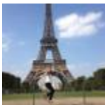
Kelley McLain @kelleylou6

We offer a one-day pass for Saturday of #AWP16 for $45, but you can only purchase it onsite on Saturday, March 2, 2016. #AWP16Reg